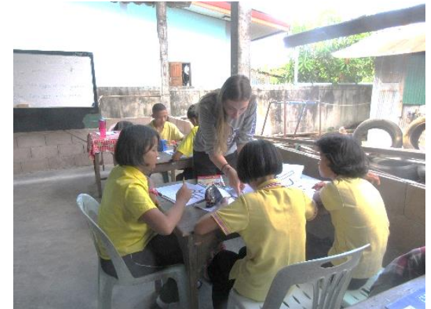
A volunteer helping students in Mae Sot